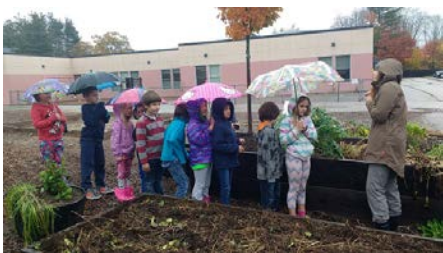
Last Cornucopia meeting of the year