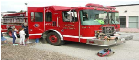
Fire Safety Week – Thank you Antrim Fire Dept.

On Wednesday October 11 th , the Antrim Fire Department came to Antrim Elementary School to celebrate Fire Safety week. Students were able to tour and sit in the town's fire truck, as well as hold the fire house and see all the gear a fire fighter uses to fight a fire. After the tour, students got to meet a couple of Antrim's own firefighters. The firefighters adorned their suits, and went over proper fire safety protocols with all students, from "Stop, Drop and Roll" to having an evacuation plan in case of a fire and the importance of working smoke detectors. The students enjoyed touring the fire trucks and seeing the firefighters in their full suits. A big thank you to Antrim's Fire Department for coming in and teaching our students about fire safety.