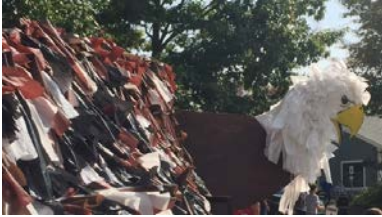
"Best Float" in Antrim's Home & Harvest Parade