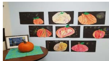
Pumpkins in the Starry Night

In October the fourth graders are going to be engaged in a variety of new and challenging topics that will expand their knowledge and understanding in all subject areas. In reading, we will continue reading fiction stories, moving from realistic fiction to historical fiction. The next story we are going to read a story called "Lewis and Clark and Me".